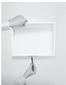
Mark bottom or side edges with a sharp pencil.

The advantage of this new drilling jig is its higher flexibility. Due to its size the new drilling jig allows easier positioning of single clamps to mount your Cubit® to the wall. We always recommend wall mounting with a shelf-height as of 1.40m. In case there are children living in your household, we always recommend wall mounting in order to stabilise the shelf. If you are not sure where to fix your shelf check the assembly instructions, please.