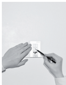
Mark drill holes using the jig.