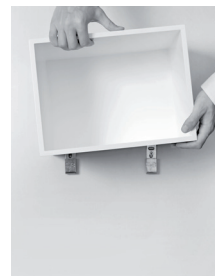
Hang Cubit® module. Finished!